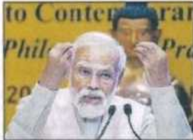
Modi at the inauguration of the Global Buddhist Summit on Thursday.