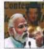
Modi said that attempts are being made to improve world's thoughts and faith in others of the Global Buddhist Summit here.

To call Buddhist teachings a way out "is the wish of all the devotees of Buddha of people like us who have faith in Lord Buddha, who believe in the values of all the religions. This book, this talk is the biggest attempt. Where there is hope, there, Buddha's teachings will be-