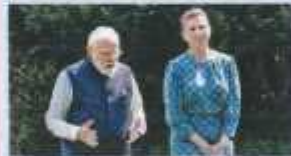
PM Narendra Modi on Thursday held a telephonic conversation with his Danish counterpart Mette Frederiksen. The 2 leaders reviewed the progress of the India-Denmark Green Strategic Partnership. They expressed satisfaction at the recent high-level exchanges & growing cooperation between 2 nations.