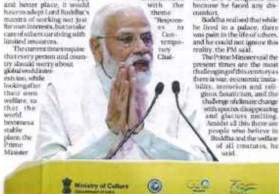
Prime Minister Narendra Modi speaking at a podium during the inauguration of the Global Buddhist Summit 2023.

He said there is the need to come out of the delusions of materialism and selfishness and imbibe the teaching of Bhawan Sri Sanghvi, i.e. Buddha should not only be made a symbol but also