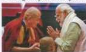
Prime Minister Narendra Modi greets a Buddhist monk during the inauguration of the Global Buddhist Summit in New Delhi on Thursday.

Prime Minister Narendra Modi on Thursday said that the world is passing through challenges such as war, economic instability, terrorism, religious extremism and climate change and asserted that Lord Buddha's ideas offer a solution to these problems. Addressing the inaugural session of the two-day Global Buddhist Summit in the national capital, the PM said that the current time in the world challenges the idea of this century as there is war, economic instability, terrorism and religious extremism, along with the challenge of climate change with species disappearing and glaciers melting. "Besides all this, there are people who believe in Buddha and the wisdom of all religions. This hope, this faith is the biggest strength of this earth. When this hope gets united, the Buddha's Dharma will become the world's belief and the Buddha's realisation will become