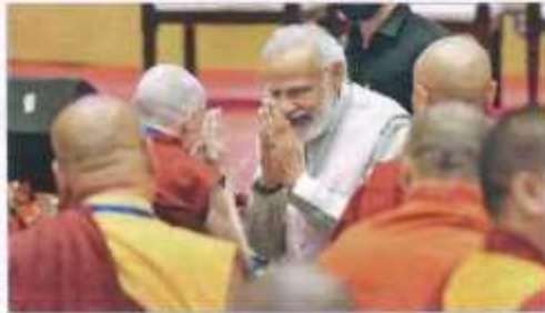
Prime Minister Narendra Modi exchanges greetings with a Buddhist monk at the inaugural session of the Global Buddhist Summit 2023, in New Delhi on Thursday.

Modi also said that India has not given war to world, but 'Buddha'. "We improved the Buddha Circuit in India and Nepal. He is Kushinagar International Airport or Lambini, where India International Centre for Buddhist Culture is being established; India is working holistically in this direction," said PM. Modi also mentioned the Russia-Ukraine war in his speech.