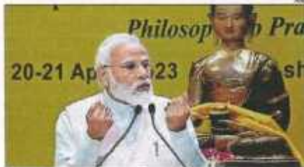
Prime Minister Narendra Modi addresses the inaugural session of the Global Buddhist Summit, in New Delhi on Thursday

He said Buddhism could offer a way out. "In the midst of all this, there are millions of people like us who have faith in