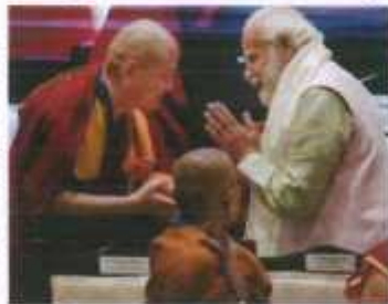
Prime Minister Narendra Modi greets a Buddhist monk during the inauguration of Global Buddhist Summit 2023 in New Delhi on Thursday.

"Taking a swipe at such notions, the Prime Minister said that the world is facing a climate change crisis now because in the last century 'some countries stopped thinking about others and the coming generations. For decades they kept thinking that meddling with nature will not respect them. They kept putting it on others."