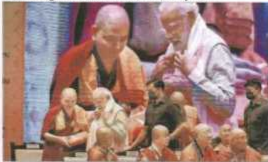
Prime Minister Narendra Modi on Thursday said the world is passing through challenges such as war, economic instability, terrorism, religious extremism and climate change and asserted that Lord Buddha's ideas offer a solution to these problems.