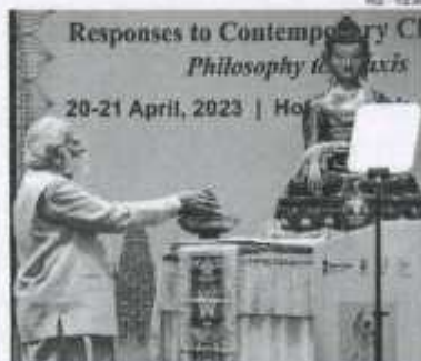
नई दिल्ली में बुद्धजय बौद्ध विलस उद्घाटन के अवसर पर प्रधानमंत्री नरेंद्र मोदी।