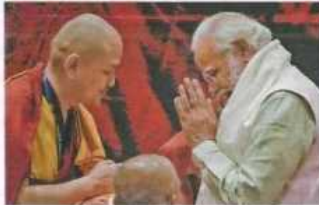
Prime Minister Narendra Modi greets a Buddhist monk during the inauguration of the Global Buddhist Summit 2023 in New Delhi on Thursday.

"Amidst all this, there are people who believe in Buddha and the welfare of all creatures. This hope, this faith is the biggest