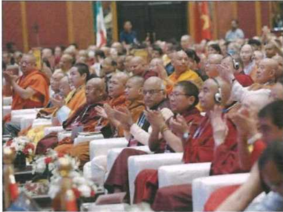
Gathering at the inaugural session of Global Buddhist Summit 2023, in New Delhi on Thursday. PM Narendra Modi addressing on the occasion.