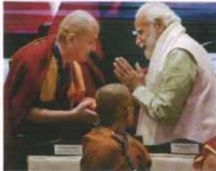
Prime Minister Narendra Modi greets a Buddhist monk during the inauguration of Global Buddhist Summit 2023 in New Delhi on Thursday.

Taking a swipe at rich nations, the Prime Minister said that the world is facing a climate change crisis now because in the last century "some countries stopped thinking about others and the coming generations. For decades they kept thinking that meddling with nature will not impact them. They kept putting it on others".