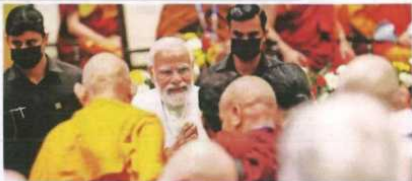
Prime Minister Narendra Modi at the inauguration of Global Buddhist Summit 2023, in New Delhi, Thursday.