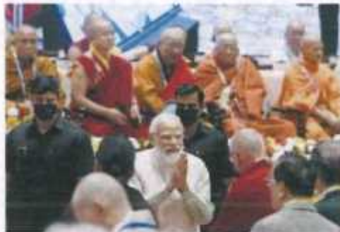
PM Narendra Modi greets a Buddhist monk during the inauguration of Global Buddhist Summit 2023 in New Delhi on Thursday