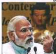
Modi said that attempts are being made to impose one's thoughts and faith on others

"It is universally accepted that today's time is the most challenging time of this century. On the one hand, two countries are at war for months, on the other hand, the world is also going through economic instability. Threats like terrorism and religious fanaticism are attacking the soul of humanity. A challenge like climate change is looming large over the existence of the entire humanity. Glaciers are melting, ecology is being destroyed, species are going extinct," the PM said in his address during the inaugural session of the Global Buddhist Summit here.