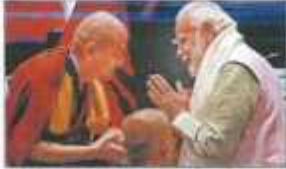
शिखर में नए वैश्विक बौद्ध शिखर सम्मेलन में पीएम मोदी: 16/04

नई दिल्ली: प्रधानमंत्री मोदी ने कहा कि दुनिया बुद्ध, जैसिक जैसिक, आत्मकर्म, अहिंसक व्यवहार और समन्वय जैसे-जैसे वैश्विक हितों को भी प्राथमिकता दें देश को समर्थन दे दें। दुनिया को एक साथ आगे बढ़ाने के लिए हमें बुद्ध के विचारों को अपनाना होगा। दुनिया को एक साथ आगे बढ़ाने के लिए हमें बुद्ध के विचारों को अपनाना होगा।