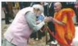
PM Narendra Modi said that there will be no problems in the world when solutions could be found in the teachings of Lord Buddha.

To call Buddhist teachings a way out "is the wish of all the devotees of Buddha of people like us who have faith in Lord Buddha, who believe in the values of all the religions. This book, this talk is the biggest attempt. Where there is hope, there, Buddha's teachings will be-