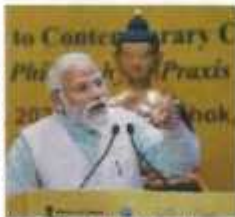
Prime Minister Narendra Modi addresses during the Inauguration of Global Buddhist Summit 2023 on Thursday in New Delhi.

shown by Lord Buddha is the "path of the future and non-violence", the Prime Minister also said that "that the world followed the teachings of Lord Buddha is the only way to achieve a better state change in the world".