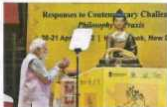
Prime Minister Narendra Modi at the inauguration of the Global Buddhist Summit 2022 in New Delhi. www.pib.gov.in

A better and stable world could be achieved only by considering the na-