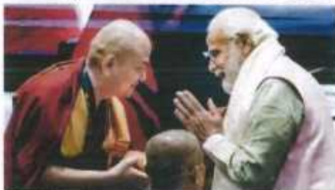
Prime Minister Narendra Modi greets a Buddhist monk during the inauguration of Global Buddhist Summit 2023 in New Delhi on Thursday.

Modi, speaking at the Global Buddhist Summit's opening session, emphasized that it was crucial for people and nations to prioritize global interests alongside their own, noting that the current century's most daunting challenges include war, economic instability, terrorism, religious extremism, and climate change. Impacts like vanishing species and melting glaciers, he said, are still relevant to today's problems. He stressed that happiness lies in unity, and self-examination should come before preaching to others to com-