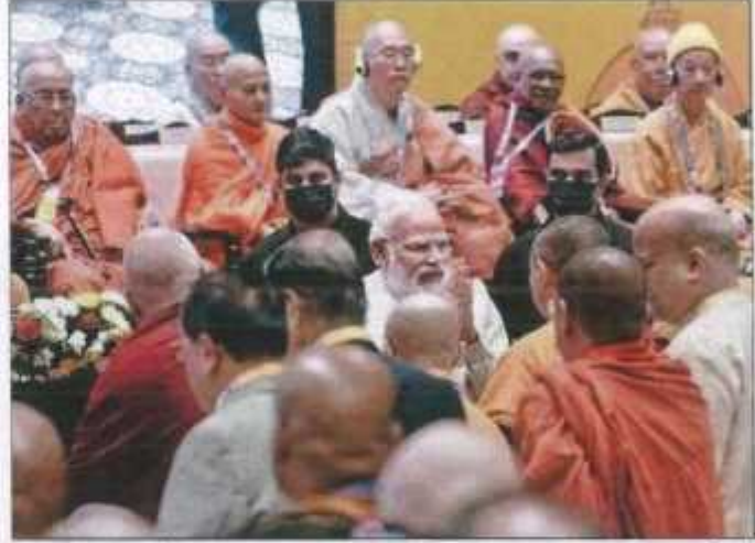
नवी दिल्ली : बौद्ध संघटनांच्या प्रतिनिधींशी संवाद साधताना पंतप्रधान मोदी.

पंतप्रधान म्हणाले, बुद्धांचा मार्ग हाच भविष्याचा मार्ग आहे. गेल्या शतकात काही देशांनी येणाऱ्या पिढ्यांबद्दल विचार न केल्याने हवामान बदलासारखे संकट आले आहे. आज प्रत्येक व्यक्तीचे काम कुठल्या ना कुठल्या स्वरूपात धरतील प्रभावित करित आहे. जीवनशैलीचाही प्रभावदेखील वसुंधरेवर पडत आहे. मात्र, आपण ठरवले तर पृथ्वीला या संकटातून वाचवू शकतो. प्रत्येक व्यक्ती हवामान बदलाच्या समस्येचा सामना करू शकतो. नागरिकांना जागरूक होऊन प्रयत्न करण्याची