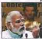
PM said world's problems are being solved by Buddhist teachings and faith in others.

"In the world of all this, there are millions of people who have faith in their