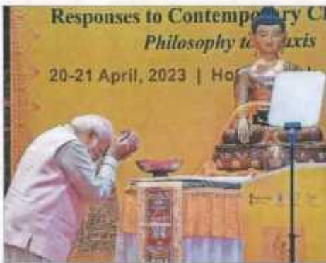
Prime Minister Narendra Modi during the inauguration of Global Buddhist Summit 2023, in New Delhi on Thursday.

ing that meddling with nature will not impact them. They kept putting it on others," he said.