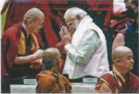
Prime Minister Modi being greeted by a monk during the Global Buddhist Summit 2023, in New Delhi on Thursday

Emphasising that the path shown by Lord Buddha is the "path of the future and